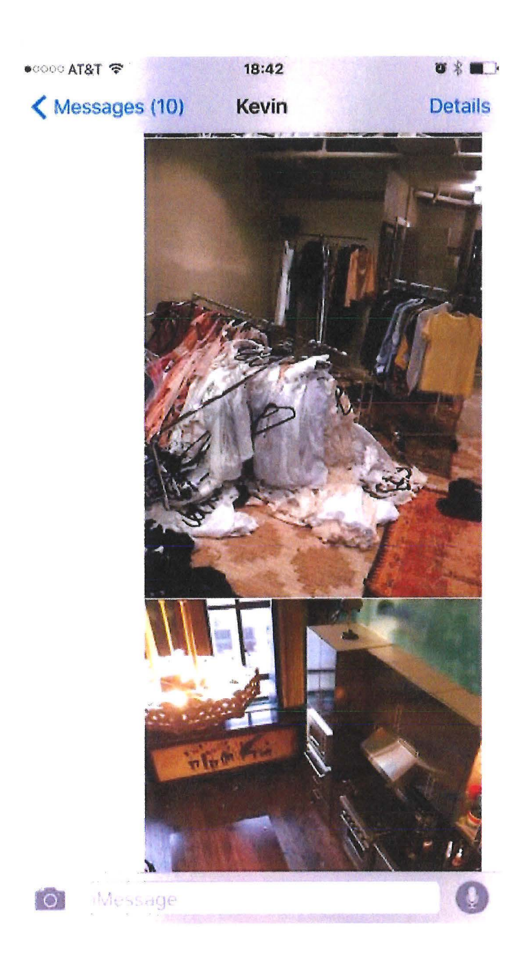
Heard - MTD Exhibits - 33